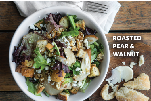
ROASTED PEAR & WALNUT

COMES WITH BREAD *EXTRA DRESSING .75¢ DRESSINGS & VINAIGRETTES Creamy ranch Blue cheese Creamy Italian Caesar Pomegranate balsamic vinaigrette* Roasted garlic citrus vinaigrette* Low fat raspberry vinaigrette Lemon herb vinaigrette* *MADE IN-HOUSE