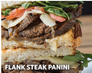
FLANK STEAK PANINI

TORTA MEXICANA ➡️ 🌿 | 12.75 Fresh Chicken Cutlet, fresh mozzarella, avocado creama, tomato, salsa, lettuce & mayo on Crusty Italian Bread.